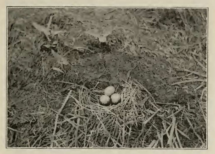
NEST AND EGGS OF BLACK TERN

The title of this paper is not literally accurate, as the territory included parts of several farms as well as the home place. The notes on which the report is based were made during the summer months in the years 1907-1911 inclusive. The land of the farm and surrounding territory is typical prairie land lying in the eastern edge of the county. It is